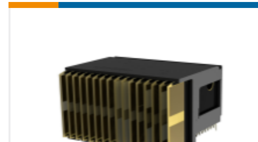
TE Part # 2286250-1 MULTIGIG RT 2-R, 7RW