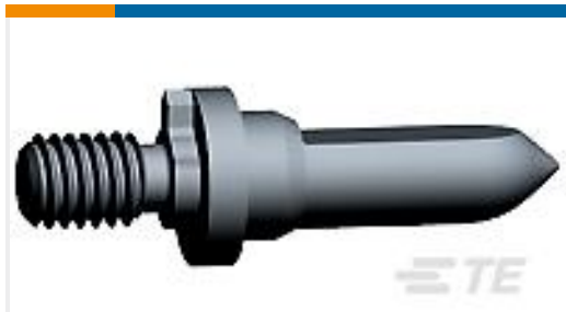
TE Part # 2000676-1 Keyed Guide Pin, Machined, Vita 46